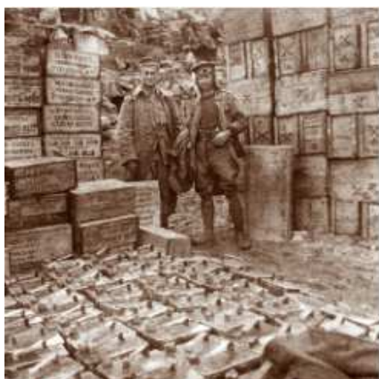
Piles of stores, mostly tinned meat or "bully beef", stand on the beach at Anzac.

We look forward to another successful event, now in its fourth year, and the participation of our senior student body.