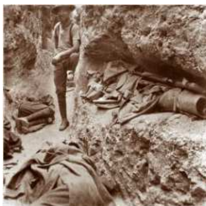
Australian troops resting in a deep communications trench leading to the nearby front line and thought to be near 400 Plateau. The Gallipoli trenches needed little stabilisation, and niches could be cut into the walls for men to sleep in or, in this case, to store equipment. Resting troops would soon have to take their turn in the front line.